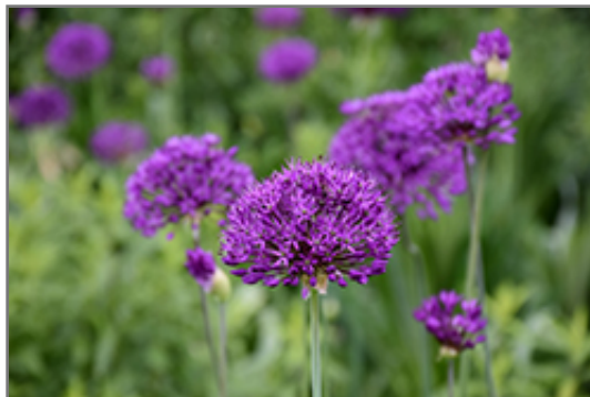
Purple Sensation Ornamental Onion flowers

Purple Sensation Ornamental Onion is recommended for the following landscape applications;