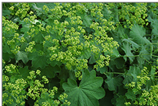
Lady's Mantle flowers