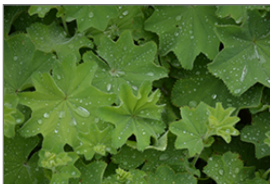
Lady's Mantle foliage