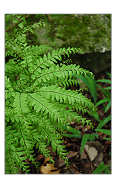
Northern Maidenhair Fern foliage

Northern Maidenhair Fern is primarily valued in the garden for its cascading habit of growth. Its crinkled ferny compound leaves are light green in color. As an added bonus, the foliage turns a gorgeous gold in the fall. The black stems are very colorful and add to the overall interest of the plant.