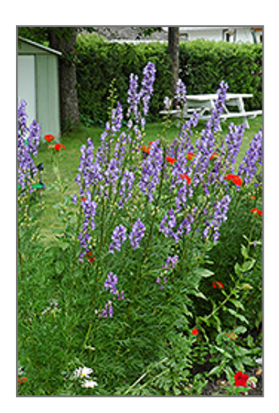
Common Monkshood in bloom