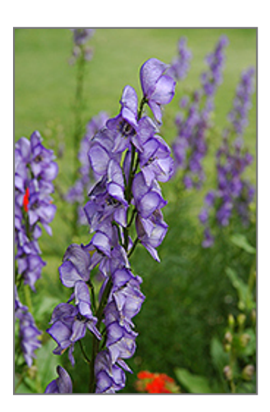
Common Monkshood flowers