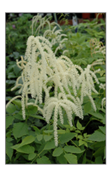
Sylvester Goatsbeard flowers

Sylvester Goatsbeard features airy spikes of creamy white flowers at the ends of the stems from late spring to mid summer. The flowers are excellent for cutting. Its serrated pointy compound leaves emerge chartreuse in spring, turning emerald green in color throughout the season.