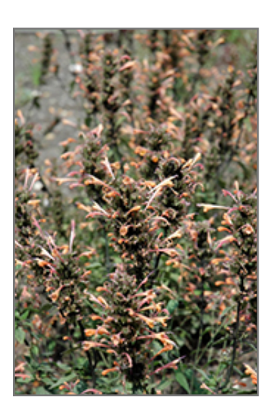
Summer Sunset Hyssop flowers

Warm orange-peach flowers that bloom all summer long; refreshing licorice scented foliage; an improved, dense mounded habit; tubular flowers attract pollinators to the garden