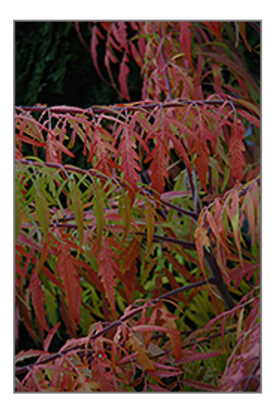
Tiger Eyes Sumac in fall

This shrub does best in full sun to partial shade. It does best in average to evenly moist conditions, but will not tolerate standing water. It is not particular as to soil type or pH. It is highly tolerant of urban pollution and will even thrive in inner city environments. This is a selection of a native North American species.