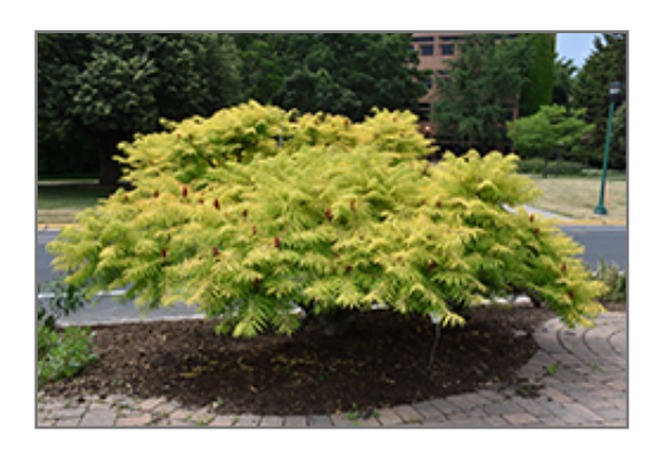
Tiger Eyes Sumac