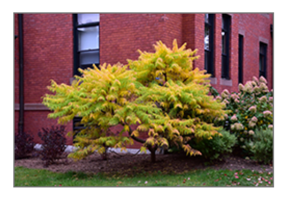
Tiger Eyes Sumac in fall