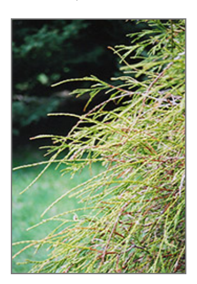
Threadleaf Arborvitae foliage