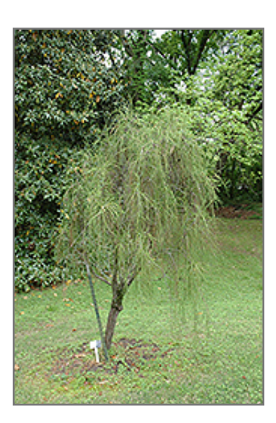
Threadleaf Arborvitae