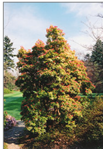
Valley Fire Japanese Pieris

* This is a 'special order' plant - contact store for details