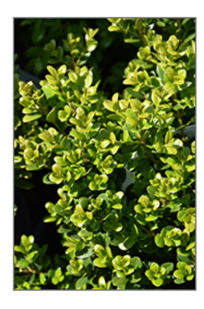
Little Missy Boxwood foliage

This is a relatively low maintenance shrub, and can be pruned at anytime. It is a good choice for attracting bees to your yard, but is not particularly attractive to deer who tend to leave it alone in favor of tastier treats. It has no significant negative characteristics.