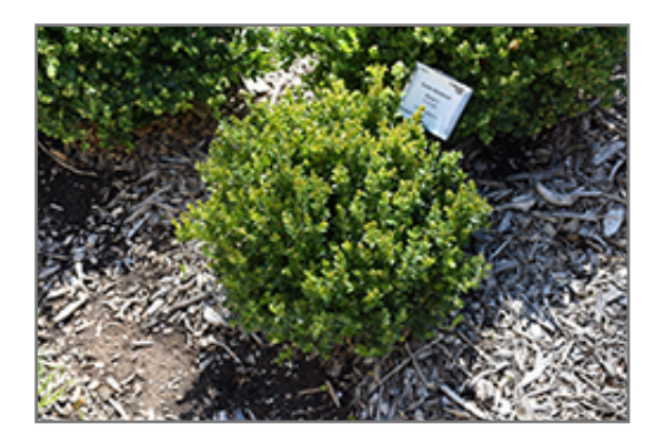
Little Missy Boxwood

Little Missy Boxwood is recommended for the following landscape applications;