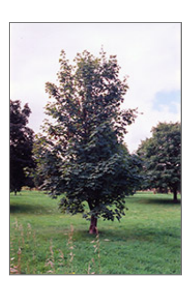
Sycamore Maple

Sycamore Maple has dark green deciduous foliage on a tree with an oval habit of growth. The lobed leaves turn an outstanding burgundy in the fall.