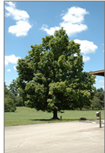
Bonfire Sugar Maple

This tree should only be grown in full sunlight. It prefers to grow in average to moist conditions, and shouldn't be allowed to dry out. It is not particular as to soil pH, but grows best in rich soils. It is somewhat tolerant of urban pollution. This is a selection of a native North American species.