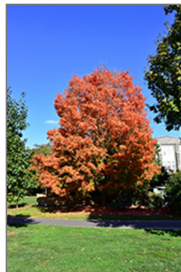
Bonfire Sugar Maple in fall