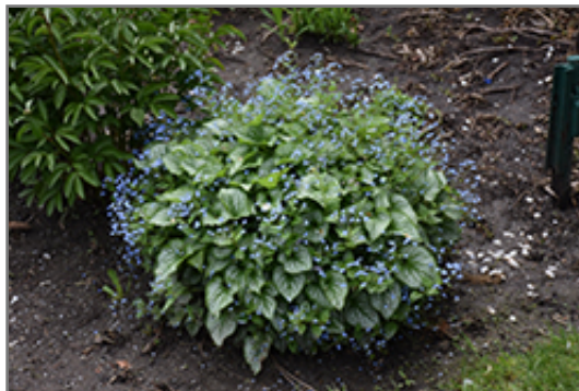
Sea Heart Bugloss in bloom

Sea Heart Bugloss is a fine choice for the garden, but it is also a good selection for planting in outdoor pots and containers. It is often used as a 'filler' in the 'spiller-thriller-filler' container combination, providing a mass of flowers and foliage against which the thriller plants stand out. Note that when growing plants in outdoor containers and baskets, they may require more frequent waterings than they would in the yard or garden.