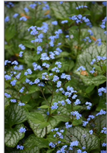
Sea Heart Bugloss flowers