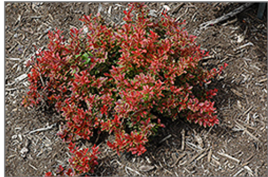
Lutin Rouge Japanese Barberry