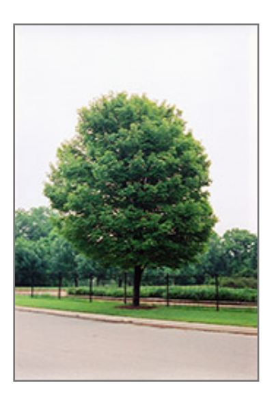
Scanlon Red Maple

Scanlon Red Maple is primarily valued in the landscape for its distinctively pyramidal habit of growth. It features showy clusters of red flowers along the branches in early spring before the leaves. It has green deciduous foliage which emerges red in spring. The lobed leaves turn an outstanding orange in the fall. The furrowed silver bark and brick red branches add an interesting dimension to the landscape.