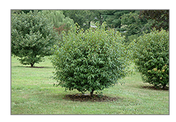
Compact Amur Maple

A compact version of the popular species with a dense, tight growth habit and brilliant scarlet fall color; ideal for garden or accent use, makes a fantastic hedge