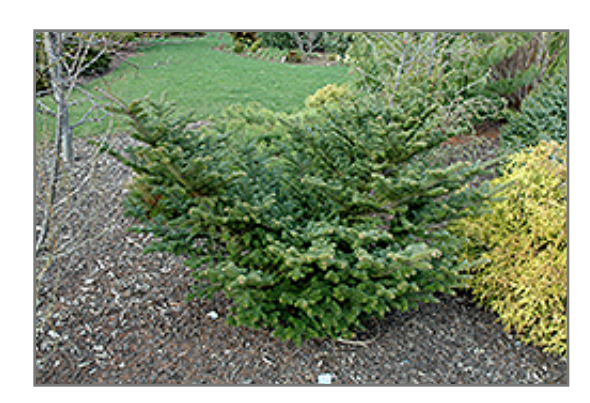
Klein's Nest Fraser Fir

A very slow growing variety with a low spreading habit; branches are covered with short medium green needles; an excellent garden accent; avoid windy, dry sites