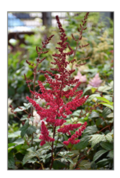
Radius Astilbe flowers