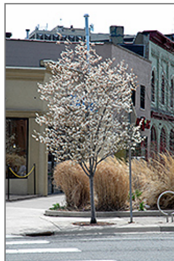
Autumn Brilliance Serviceberry in bloom