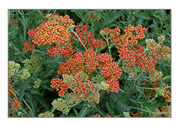
Fireland Yarrow flowers

Firey red-orange blooms with gold centers, above a compact growth habit will add interesting texture and color; excellent for xeriscaping and hot, sunny, dry locations in the garden; performs well on hot sites