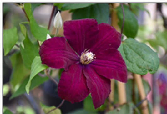
Rouge Cardinal Clematis flowers