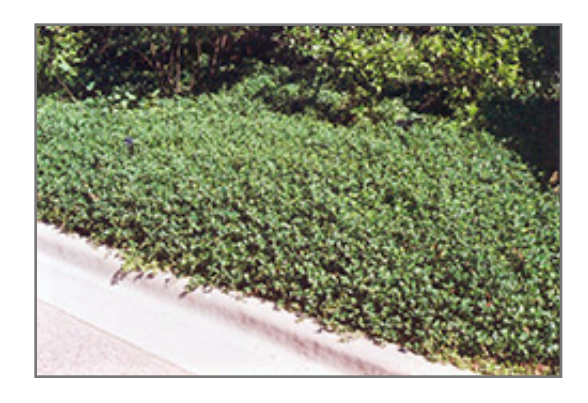
Bowles Periwinkle