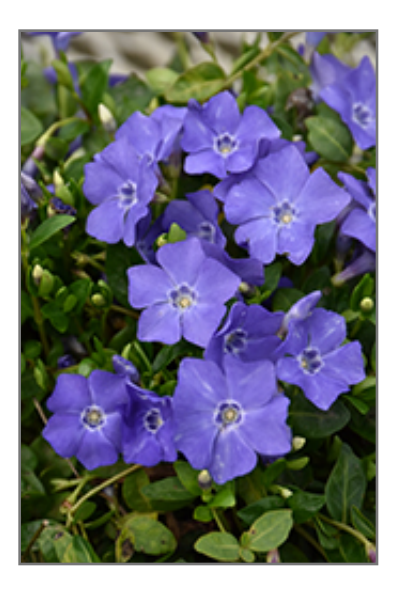
Bowles Periwinkle flowers