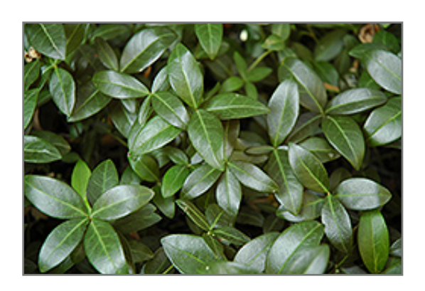
Bowles Periwinkle foliage

Bowles Periwinkle will grow to be only 4 inches tall at maturity extending to 6 inches tall with the flowers, with a spread of 18 inches. Its foliage tends to remain low and dense right to the ground. It grows at a fast rate, and under ideal conditions can be expected to live for approximately 10 years. As an evegreen perennial, this plant will typically keep its form and foliage year-round.