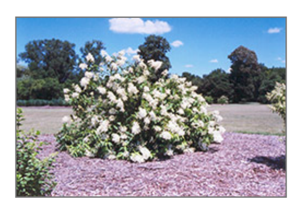
White Moth Hydrangea in bloom

A beautiful compact shrub valued for its prominent cone-shaped panicles of white flowers in summer, blooms well in shade; somewhat coarse in appearance, regular pruning recommended; needs acidic well-drained soil; a distinct improvement on other cultivars