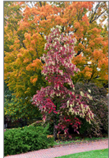
Sourwood in fall

This tree does best in full sun to partial shade. It does best in average to evenly moist conditions, but will not tolerate standing water. It is very fussy about its soil conditions and must have rich, acidic soils to ensure success, and is subject to chlorosis (yellowing) of the foliage in alkaline soils. It is quite intolerant of urban pollution, therefore inner city or urban streetside plantings are best avoided, and will benefit from being planted in a relatively sheltered location. Consider applying a thick mulch around the root zone in winter to protect it in exposed locations or colder microclimates. This species is native to parts of North America, and parts of it are known to be toxic to humans and animals, so care should be exercised in planting it around children and pets.