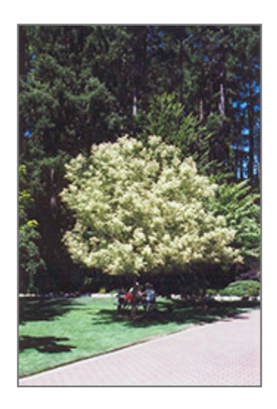
Flamingo Boxelder