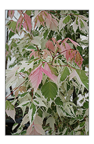
Flamingo Boxelder foliage