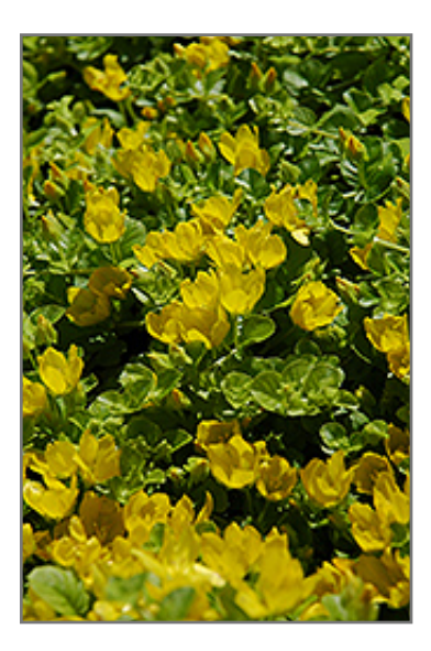
Creeping Jenny flowers

Creeping Jenny is recommended for the following landscape applications;