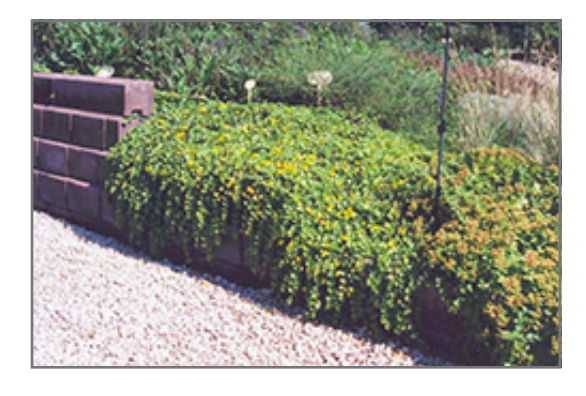
Creeping Jenny in bloom