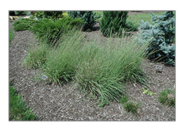
Sideoats Grama

This native variety is noted for its distinctive arrangement of oat-like that hang from only one side of the flowering stem; purplish inflorescences mature to tan as the seeds mature; blue-green foliage turns reddish-purple in fall; use as a border accent