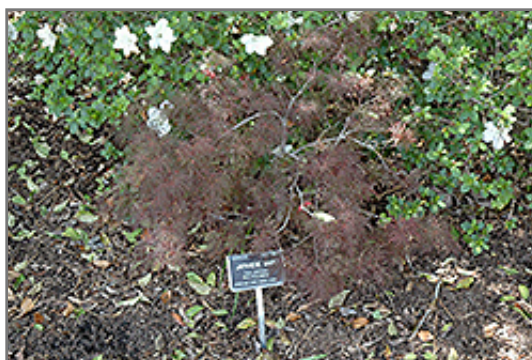
Red Feathers Japanese Maple