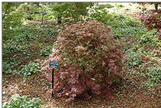
Kandy Kitchen Japanese Maple