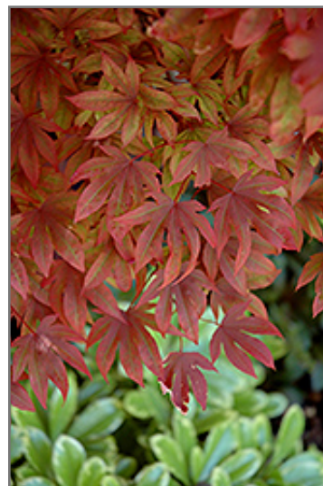
Adrians Compact Japanese Maple foliage