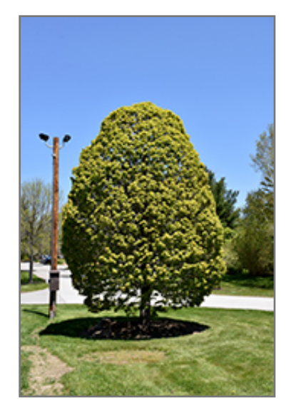
Columnar Sugar Maple

This tree should only be grown in full sunlight. It prefers to grow in average to moist conditions, and shouldn't be allowed to dry out. It is not particular as to soil pH, but grows best in rich soils. It is somewhat tolerant of urban pollution. This is a selection of a native North American species.