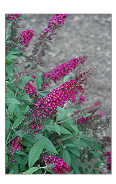
CranRazz Butterfly Bush flowers

CranRazz Butterfly Bush features showy panicles of fragrant fuchsia flowers with orange eyes and a white ring at the ends of the branches from late spring to early fall, which emerge from distinctive dark red flower buds. The flowers are excellent for cutting. It has grayish green deciduous foliage. The fuzzy narrow leaves do not develop any appreciable fall color.