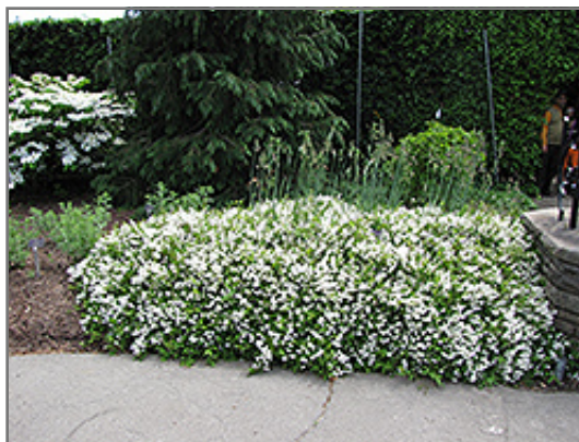
Nikko Deutzia in bloom