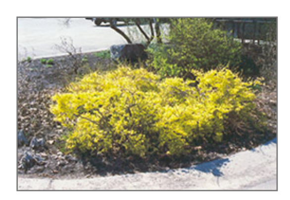
Happy Centennial Forsythia in bloom

A low growing groundcover, an unusual application for a Forsythia, yellow flowers are not as abundant as on other varieties but still ornamental; spreads vigorously, makes an excellent quick groundcover