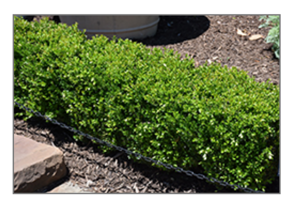
Baby Gem Boxwood

This shrub does best in full sun to partial shade. You may want to keep it away from hot, dry locations that receive direct afternoon sun or which get reflected sunlight, such as against the south side of a white wall. It prefers to grow in average to moist conditions, and shouldn't be allowed to dry out. It is not particular as to soil type or pH. It is highly tolerant of urban pollution and will even thrive in inner city environments, and will benefit from being planted in a relatively sheltered location. This is a selected variety of a species not originally from North America.