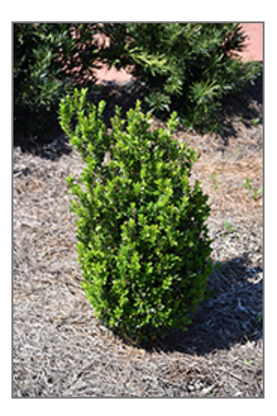
Baby Gem Boxwood