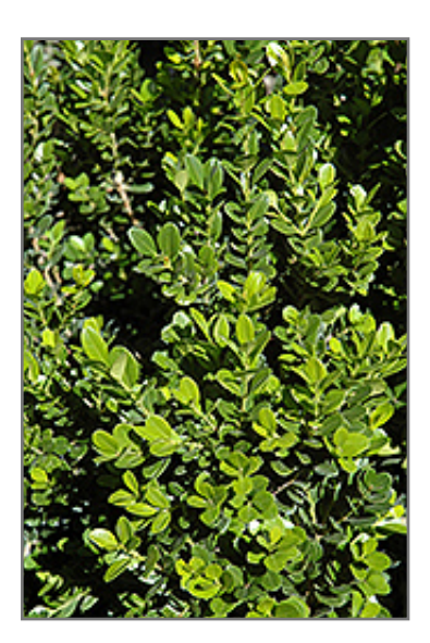
Baby Gem Boxwood foliage