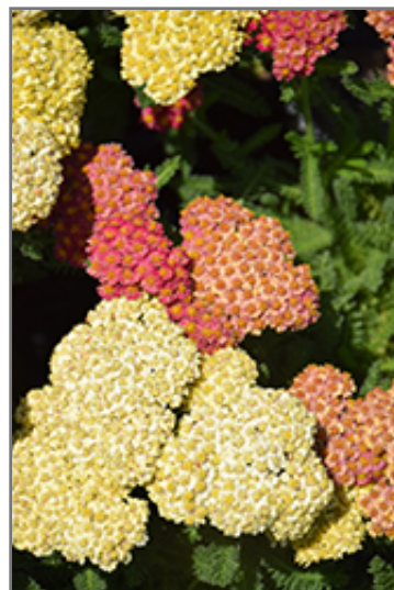
Desert Eve Terracotta Yarrow flowers

Desert Eve Terracotta Yarrow is recommended for the following landscape applications;