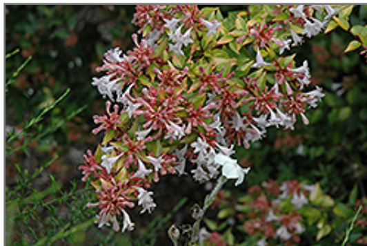
Francis Mason Abelia flowers