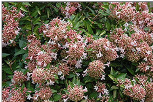
Canyon Creek Abelia flowers

Canyon Creek Abelia will grow to be about 3 feet tall at maturity, with a spread of 4 feet. It tends to fill out right to the ground and therefore doesn't necessarily require facer plants in front. It grows at a slow rate, and under ideal conditions can be expected to live for approximately 30 years.