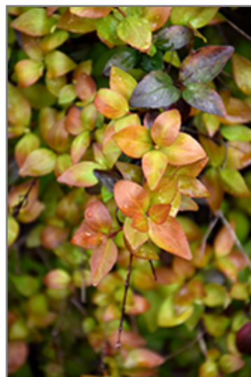
Canyon Creek Abelia foliage