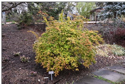
Canyon Creek Abelia

This shrub will require occasional maintenance and upkeep, and should only be pruned after flowering to avoid removing any of the current season's flowers. It is a good choice for attracting birds, bees and butterflies to your yard, but is not particularly attractive to deer who tend to leave it alone in favor of tastier treats. It has no significant negative characteristics.