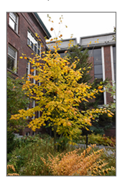
Moosewood in fall