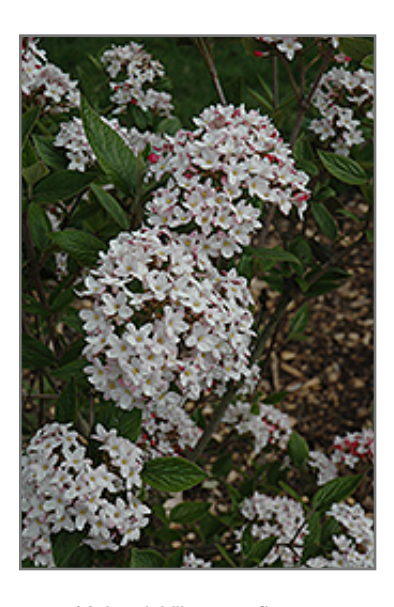
Mohawk Viburnum flowers

This shrub does best in full sun to partial shade. It prefers to grow in average to moist conditions, and shouldn't be allowed to dry out. It is not particular as to soil type or pH. It is highly tolerant of urban pollution and will even thrive in inner city environments. This particular variety is an interspecific hybrid.