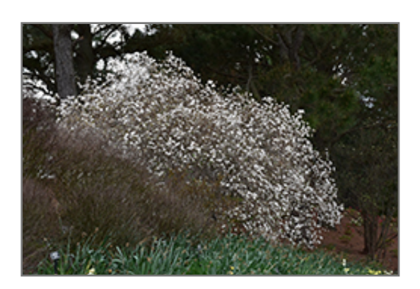
Mohawk Viburnum in bloom