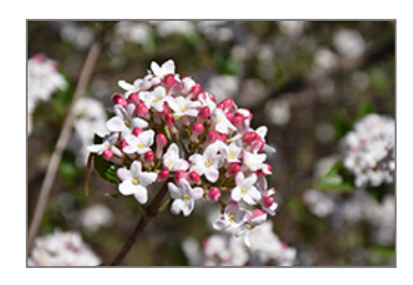
Mohawk Viburnum flowers

Mohawk Viburnum is recommended for the following landscape applications;