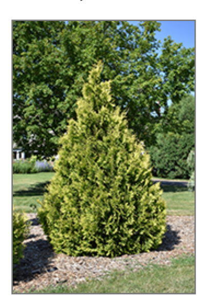
Yellow Ribbon Arborvitae