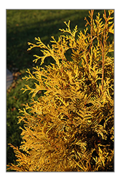
Yellow Ribbon Arborvitae in fall

This shrub does best in full sun to partial shade. It prefers to grow in average to moist conditions, and shouldn't be allowed to dry out. It is not particular as to soil type or pH. It is somewhat tolerant of urban pollution, and will benefit from being planted in a relatively sheltered location. Consider applying a thick mulch around the root zone in winter to protect it in exposed locations or colder microclimates. This is a selection of a native North American species.