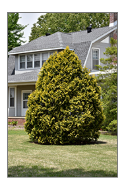
Yellow Ribbon Arborvitae