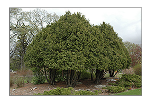
Wareana Arborvitae

An attractive and versatile evergreen, retains a bright green color all year long; very versatile, takes pruning well, makes a great hedge or specimen; eventually becomes a densely pyramidal low-branched tree; hardy and adaptable, resistant to windburn