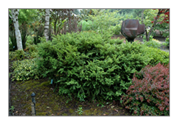
Taunton's Yew

A versatile evergreen shrub with a densely compact, spreading habit, bright green emerging foliage is held against dense, dark green needles in spring; a superb garden shrub that takes pruning very well; does well in shade, resistant to winter burn