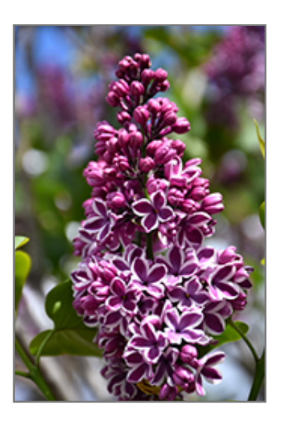
Sensation Lilac flowers

Sensation Lilac is recommended for the following landscape applications;