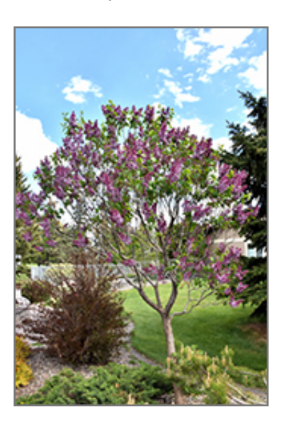
Sensation Lilac in bloom