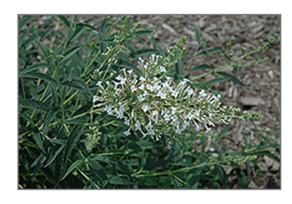
Flutterby Petite Snow White Butterfly Bush flowers

Flutterby Petite Snow White Butterfly Bush will grow to be about 30 inches tall at maturity, with a spread of 30 inches. It tends to be a little leggy, with a typical clearance of 1 foot from the ground. It grows at a fast rate, and under ideal conditions can be expected to live for approximately 20 years.