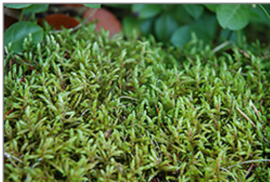
Ribbed Bog Moss foliage