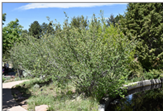
Utah Serviceberry