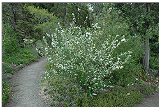
Utah Serviceberry in bloom