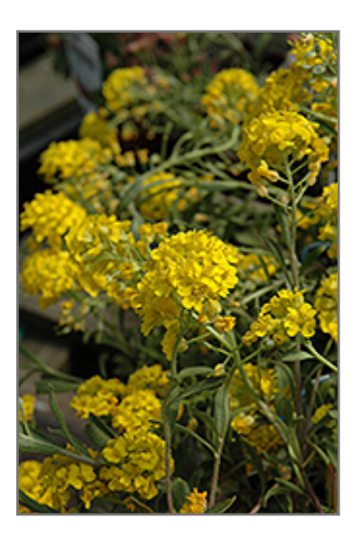
Alpine Alyssum flowers

This hardy variety is perfect for edging a sunny border or accenting a rock garden; yellow flower clusters appear above a mounded cushion of leaves in mid to late spring; evergreen in mild winter areas and drought tolerant once established