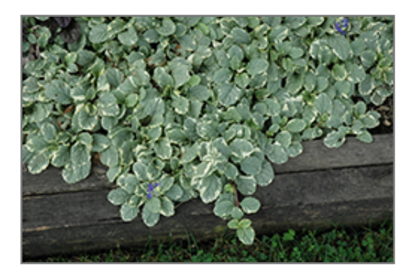
Silver Queen Bugleweed