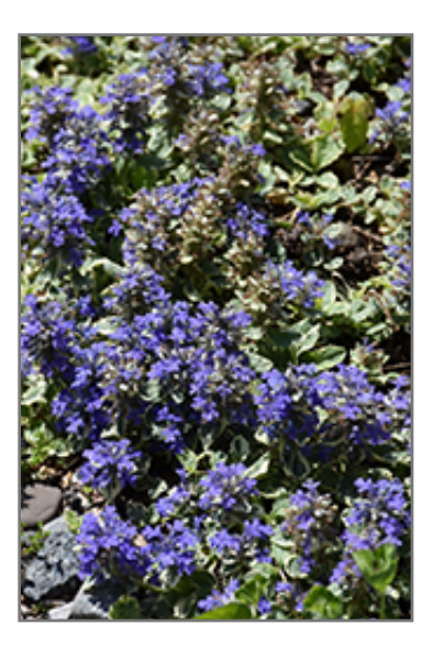
Silver Queen Bugleweed flowers

This plant does best in partial shade to shade. It does best in average to evenly moist conditions, but will not tolerate standing water. It is not particular as to soil type or pH. It is somewhat tolerant of urban pollution. Consider covering it with a thick layer of mulch in winter to protect it in exposed locations or colder microclimates. This is a selected variety of a species not originally from North America. It can be propagated by division; however, as a cultivated variety, be aware that it may be subject to certain restrictions or prohibitions on propagation.