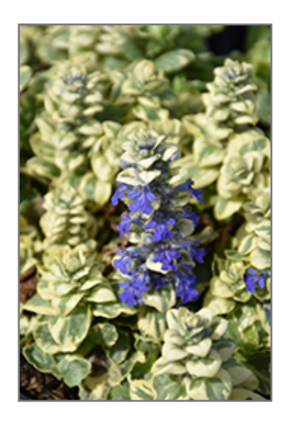
Silver Queen Bugleweed flowers