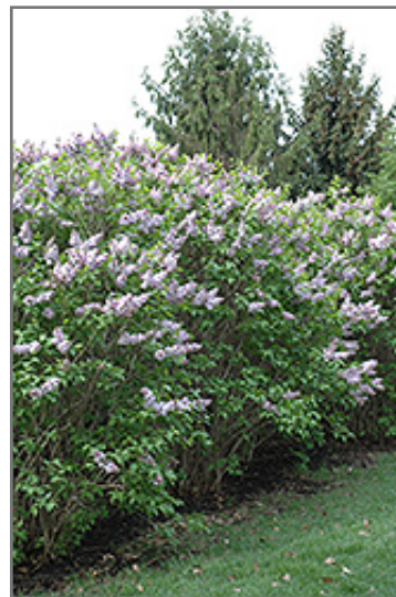
Blanche Sweet Lilac in bloom